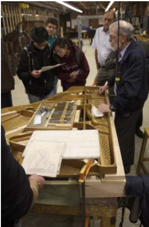
Fitting the harp