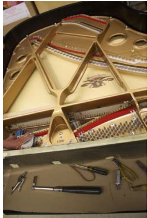
Getting some strings