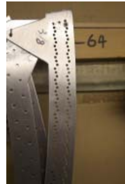
Bridge Pin Templates