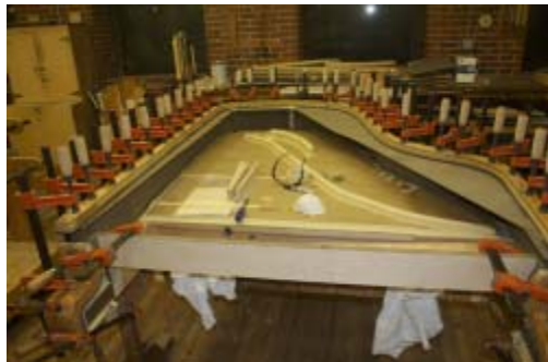
Soundboard & pinblock in - gluing some veneer