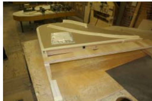
Soundboard & pinblock ready to fit in a casing