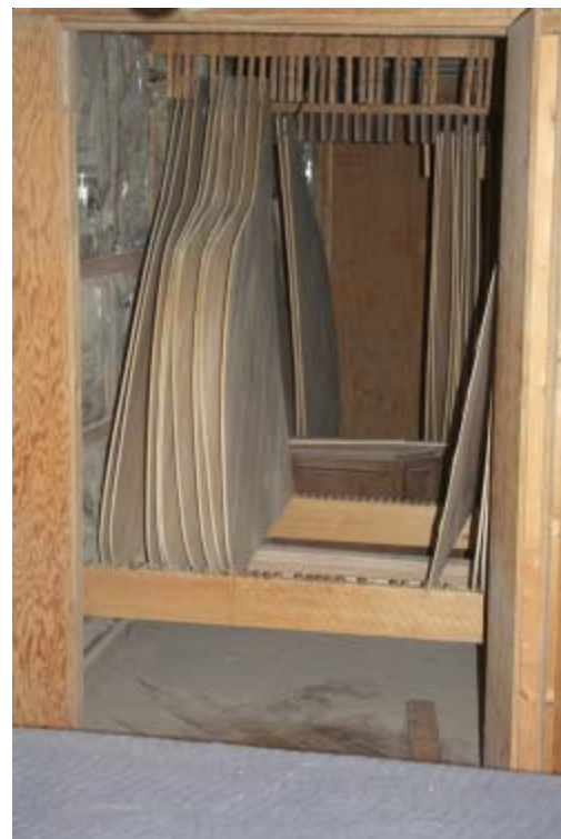
Humidity controlled drying room for soundboards