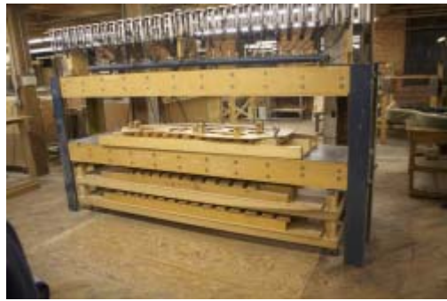
Bridge gluing press